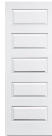
5 Panel SMOOTH – BEAD & COVE