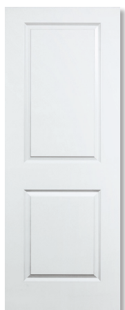
2 Panel Sqairetop SMOOTH BEAD & COVE, OVOLO