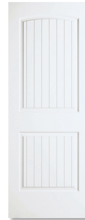
2 Panel Roundtop Plank SMOOTH OVOLO