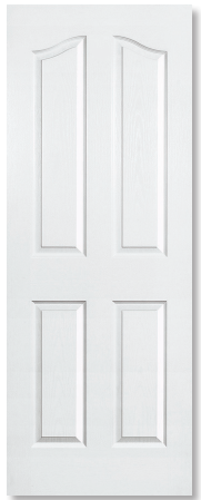
4 Panel Archtop TEXTURED – OVOLO