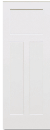
3 Panel Shaker SMOOTH SQUARE