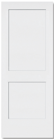
2 Panel Shaker SMOOTH SQUARE