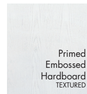
Primed Embossed Hardboard TEXTURED