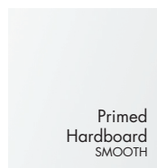
Primed Hardboard SMOOTH