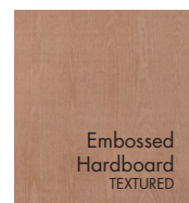
Embossed Hardboard TEXTURED