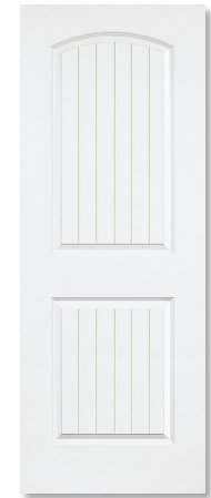
2 Panel Roundtop Plank SMOOTH TRI STEP