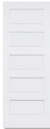
5 Panel Shaker SMOOTH STEP