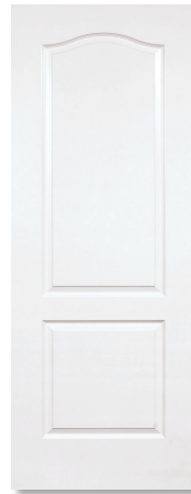
2 Panel Archtop SMOOTH & TEXTURED BEAD & COVE