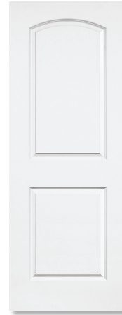
2 Panel Roundtop SMOOTH BEAD & COVE