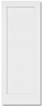
1 Panel Shaker SMOOTH SQUARE