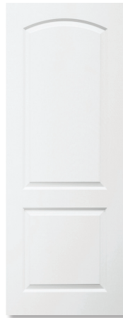
2 Panel Roundtop SMOOTH OVOLO