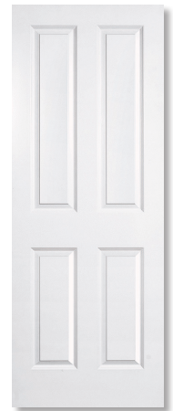
4 Panel Sqairetop SMOOTH – BEAD & COVE, OVOLO