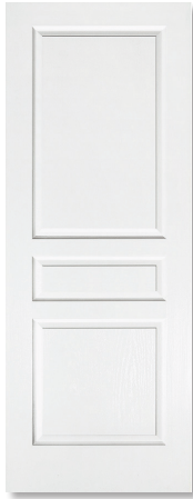
3 Panel TEXTURED – BEAD & COVE