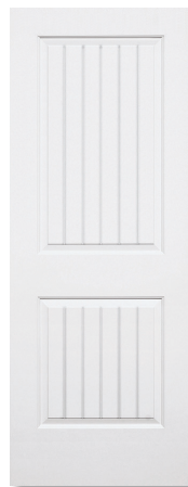
2 Panel Sqairetop Plank SMOOTH BEAD & COVE