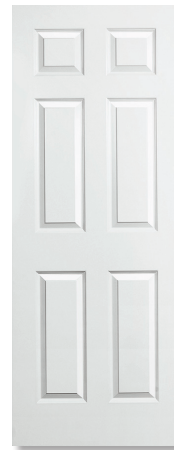
6 Panel SMOOTH & TEXTURED – BEAD & COVE TEXTURED – OVOLO